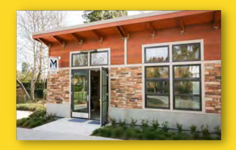
<u>WINTER HOURS</u> MON, TUES, THURS, FRI: 3:00 - 7:00 pm WED: 10 am - 12:30 pm AND 3:00 - 7:00 pm SAT: 9:00 am - 12:00 pm

Get ready for your season! Shop for TechSuits and Nadadores gear at MVProShop.